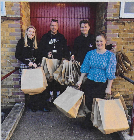
Warm pack donations