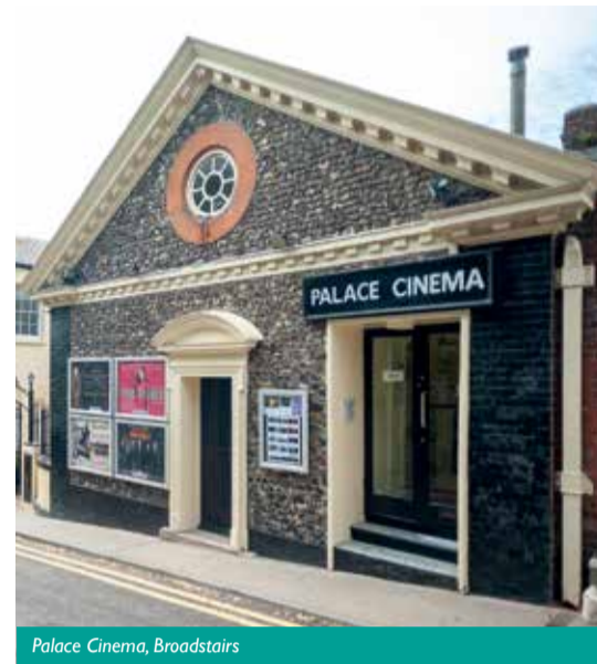
Palace Cinema, Broadstairs