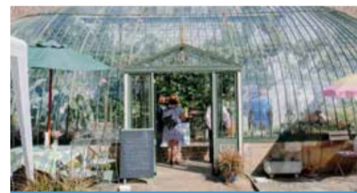
The Italianate Glasshouse, Ramsgate

Tea garden, open on fine weather days only. Limited access. No toilet facilities.